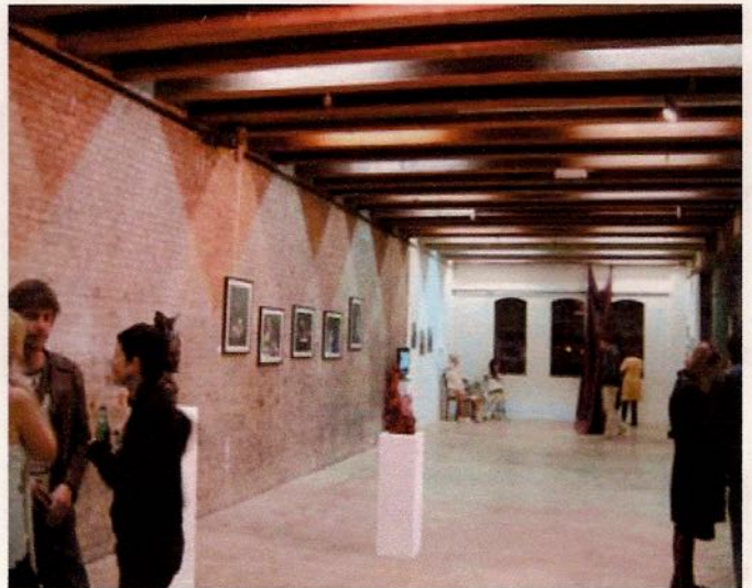
An attractive crowd mingles during the exhibition's opening at de Veevloer